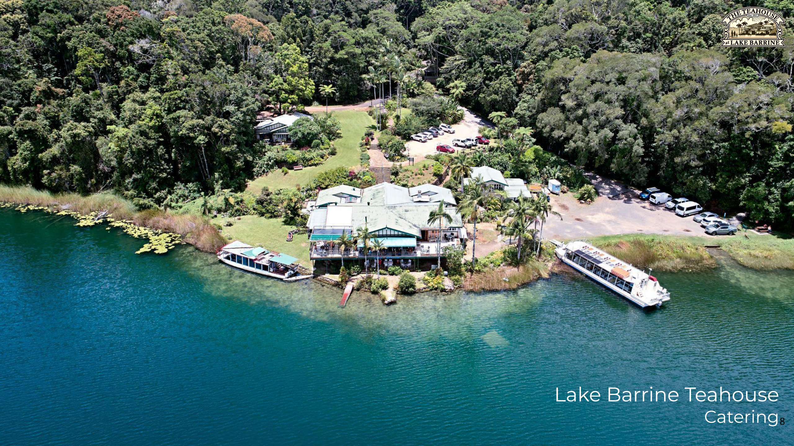
Lake Barrine Teahouse Catering 8