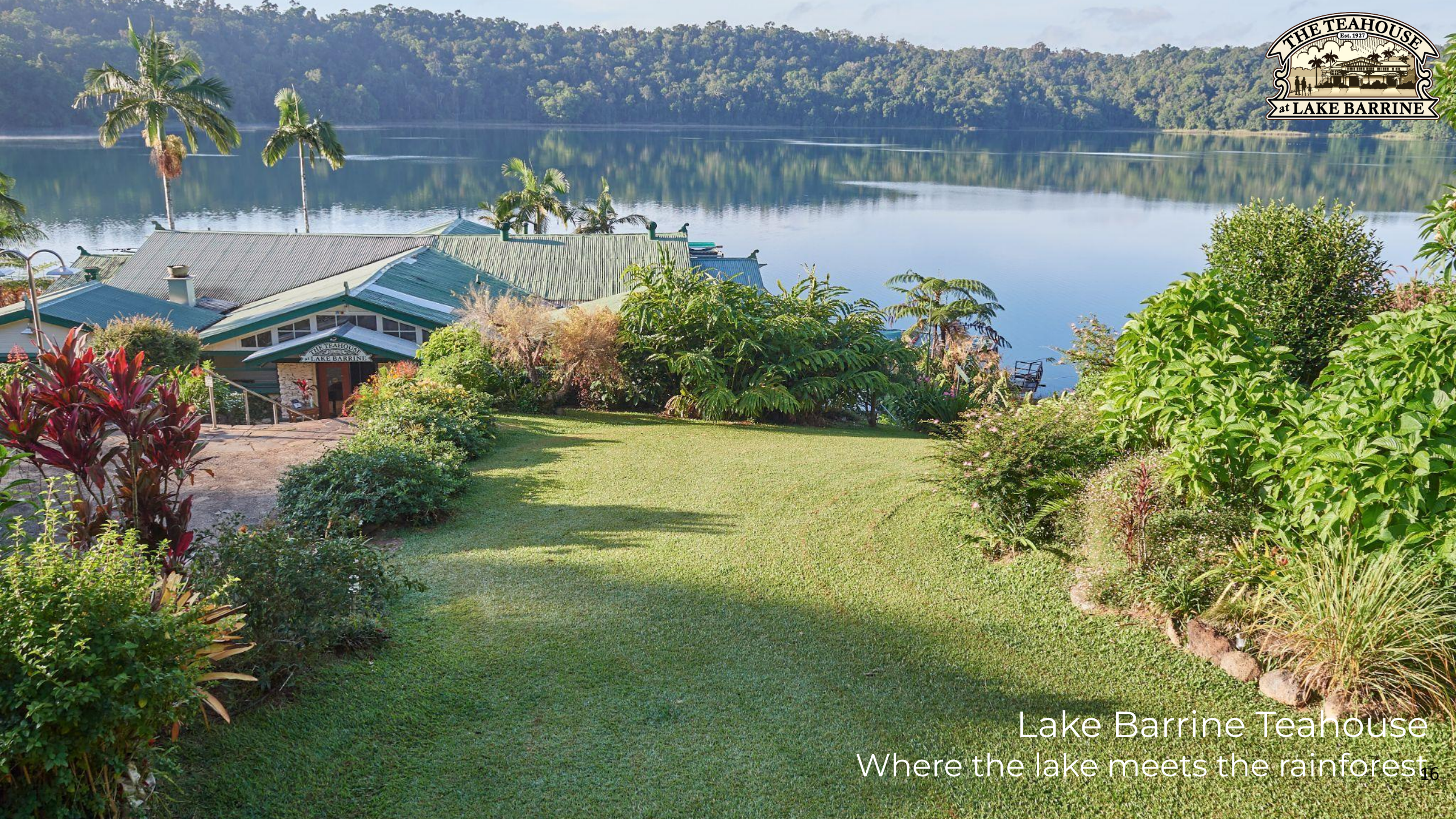
Lake Barrine Teahouse Where the lake meets the rainforest